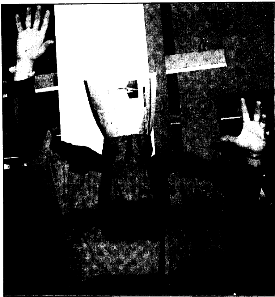
Crazy Newspaper Face poses for a rare photo.