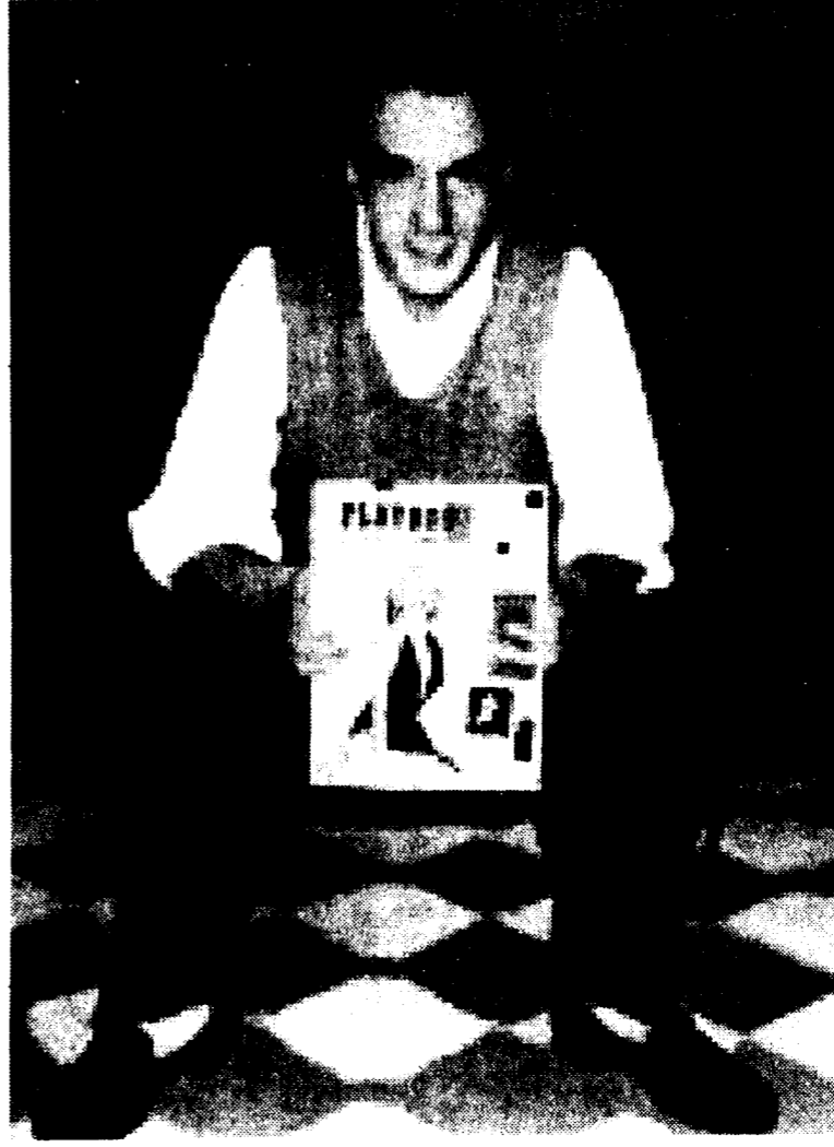
We can all agree...It was the shoes that made Hugh famous.