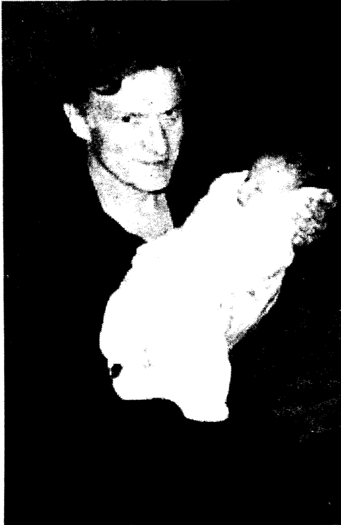
Hugh Hefner shows off a future Playboy Bunny.