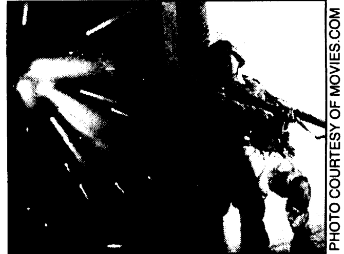
'Black Hawk Down' tells the true story of the Oct. 3, 1993, battle of Mogadishu during the Somali Civil War.

somewhere other than in "Black Hawk Down." The cast gives such a tremendous ensemble performance, there's little chance for any single cast member to stand out. Shepard, as Garrison, doesn't do much more than stare at a few television screens for