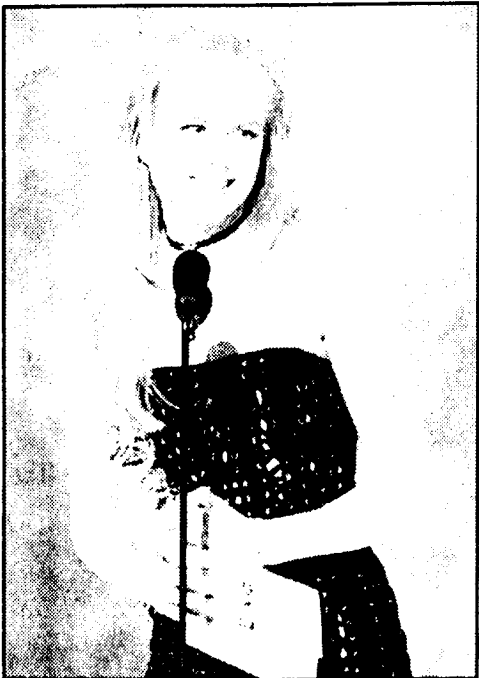
Nicole Kidman received a Golden Globe for her portrayal of the stage actress Satine in 'Moulin Rouge.'

a motion picture drama to Sissy Spacek for "In the Bedroom." "Until..." with lyrics by Sting, from the movie "Kate & Leopold" won the best original song. Sting