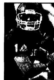
Josh Heupel looks to lead Oklahoma over Kansas State in the Big XII Championship game tomorrow.