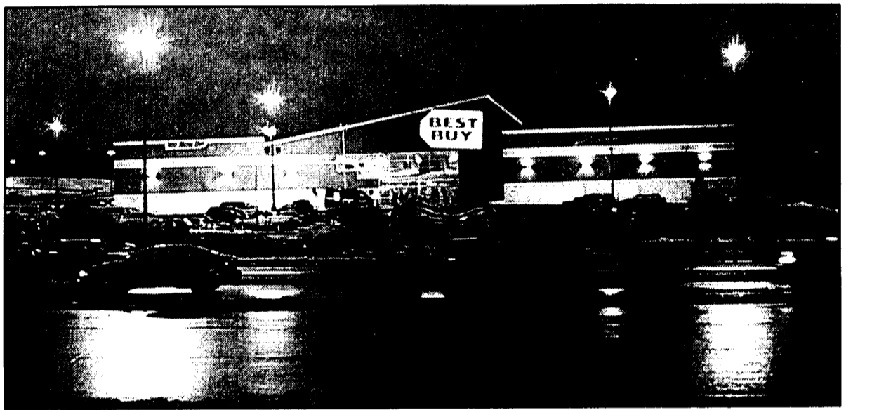
The new Best Buy on upper Peach street is open for business.

While not as much an "all-in-one" store as Target, Wal-Mart, or K-Mart, Best Buy definitely makes up for it with their prices on electronics. Their prices are definitely in the range that will lead to strong competition with other local electronic stores such as Media Play and Circuit City. The combination of the Christmas shopping season being in full bloom and the momentum that a store gains with their grand opening, it's a sure bet that Best Buy will be having a very merry Christmas season.