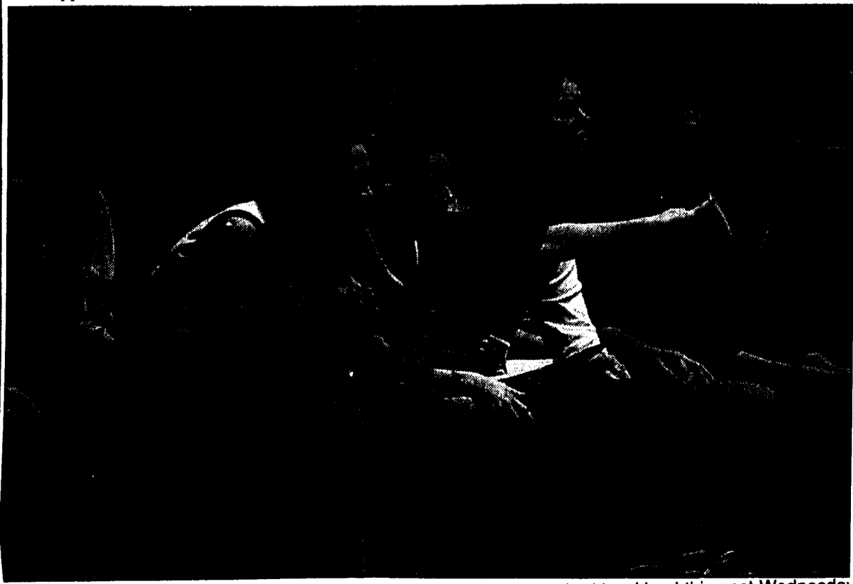
The Behrend starters get some rest as the second unit holds on to the Lions' lead this past Wednesday night against Pitt-Bradford. The women held on to the lead, winning 58-49